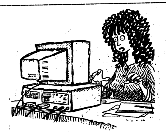
I don't see the ANY key anywhere.