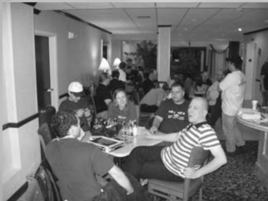
A shot of the post-expo get together. We never did manage to evict the Shriners from our "normal" room, but the hotel lobby sufficed.