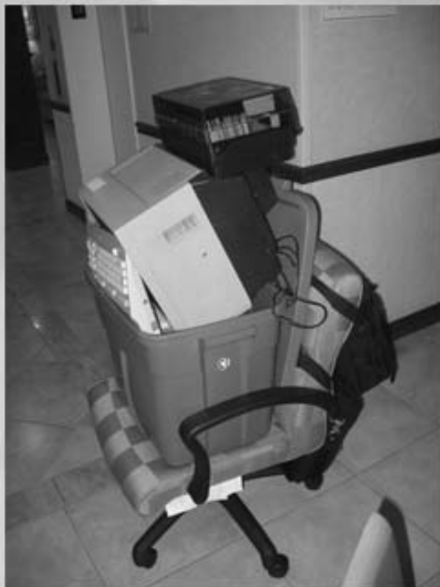
I had to move my gear like this at SWRAP 2004, and everyone laughed at me. Guess we CCCC guys set the trends... ;)