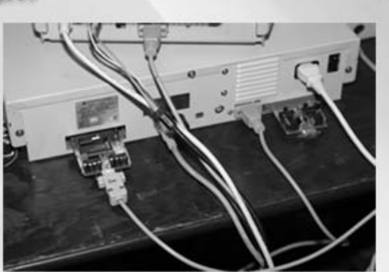
Dopple had two types of RS232 adapters for sale, a Turbo232 clone and a Swiftlink clone.