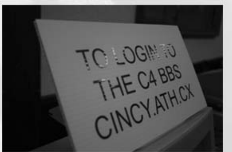
Chuck Kern (Cichlid/DLoC) had a terminal set up so people could call the CCCC BBS from the expo.