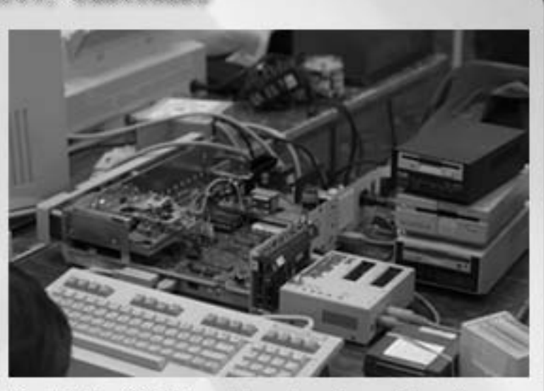
K. Dale Sidebottom had quite the impressive setup.