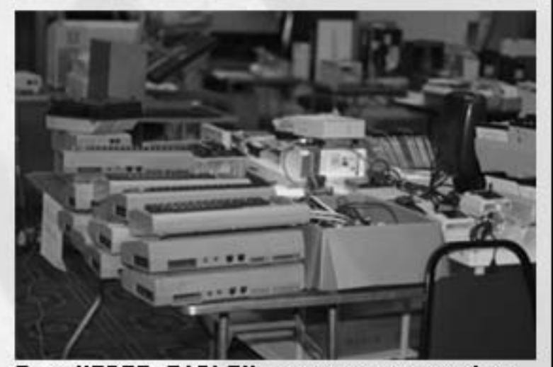
The "FREE TABLE", lots of goodies were there for the taking, and even the table itself was free.