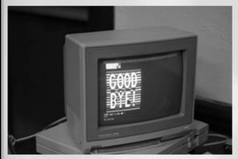
A caller loggin off of a telnet BBS from their 128D.