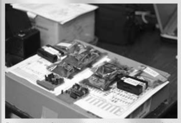
I could kick myself for not buying one of each of these RS232 adapters at C4. I immediately found myself needing one at home.