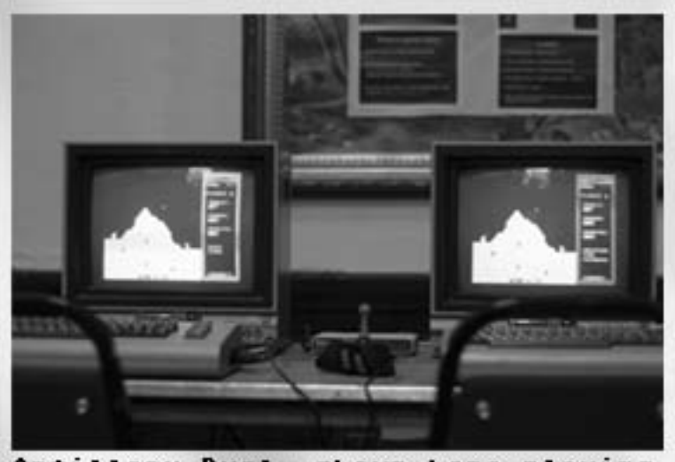
Artillery Duel, shown here playing head to head across an ethernet connection.