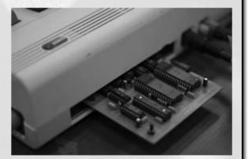
A VIC-20 multicart prototype was on display at the expo. I played Lode Runner and a few other games on it, it worked great!