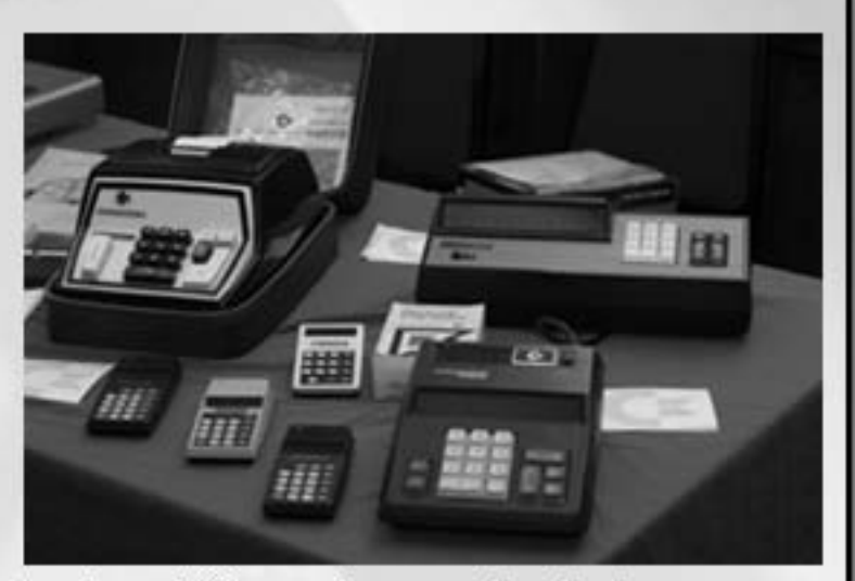
Lots of Commodore calculators were on display, including one with a really cool old tube display.