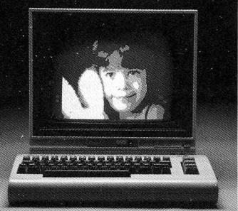
image — or combine it with text — because a version of CARDCO's Paint Now/Graph Now software is built in ... at no extra cost! Make T-shirts for your friends**, Christmas cards and birth announcements ... maps,

DIGI-CAM<sup>™</sup> is incredibly easy to use. Simply focus the video camera on your subject, view the shot on your Commodore 64® monitor, store the shot on CARDCO's DIGI-CAM software ... and print out. You can enhance or change the on-screen