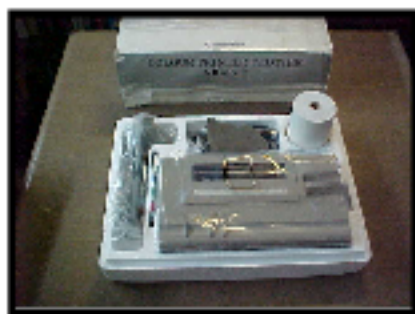
Vic 1520 Plotter

Discussed the items that No.21 brought us, and greedy hands reached for them. Getting bitten off at the elbow by the rabid and savage LR . Testing and